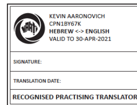
OFFICIAL DESIGN RECOGNISED PRACTISING TRANSLATOR STAMP 50 x 38mm

If the translation date is within the period of validity for the credential (ie. before the "valid to" date), NAATI's opinion is that the translation should be accepted where it has been presented.