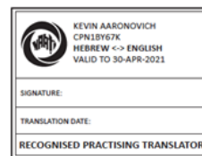
OFFICIAL DESIGN RECOGNISED PRACTISING TRANSLATOR STAMP 50 x 38mm

If the translation date is within the period of validity for the credential (ie. before the "valid to" date), NAATI's opinion is that the translation should be accepted where it has been presented.